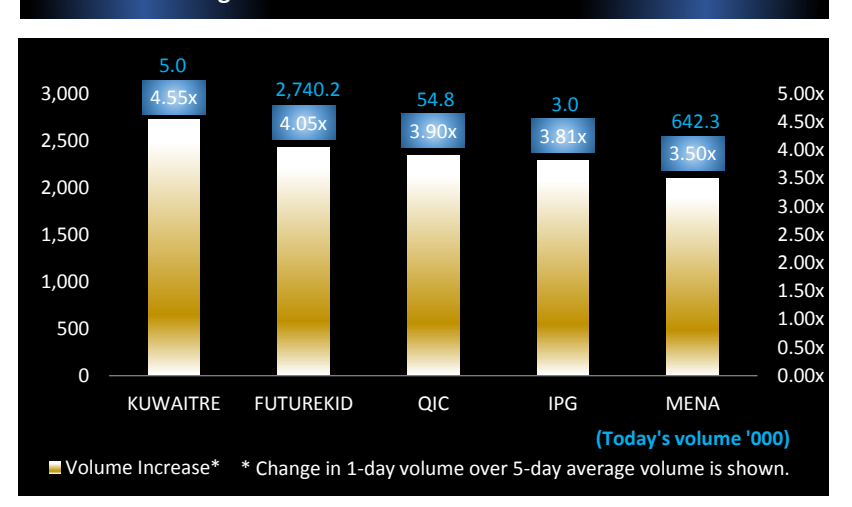
Volume Trending Stocks